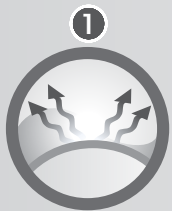
Water Vapor Escapes

The microscopic pores are crucial to preserving hay quality. In the past, farmers have covered bales with water-proof plastic, only to find mold had formed on the outside of the bale where water vapor condensed on the plastic. That doesn't happen with B-Wrap. Tama SCM technology keeps moisture from going into the bale, yet lets water vapor escape. Brilliant!