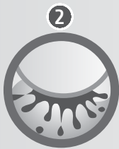
Blocks Ground Moisture