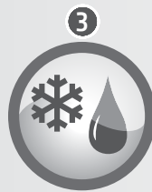
Water & Snow Resistance