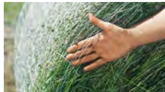
John Deere CoverEdge™ Netwrap covers 15% more surface area of the round bale.