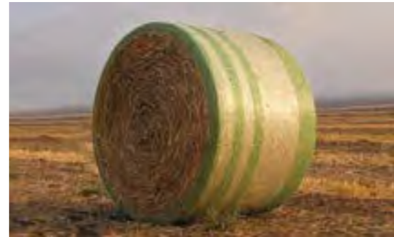
John Deere CoverEdge™ stores better in all weather conditions, as the tightly enclosed bale edges reduce the opportunity of moisture entering the bale and allows closer bale stacking for improved weather protection.